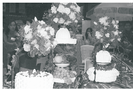
Wedding Cake Freestyle